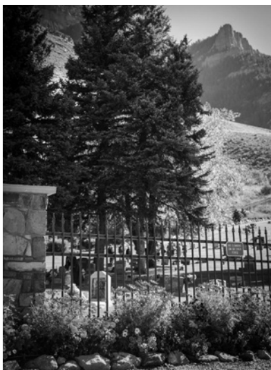
B'nai Vail Cemetery in Minturn