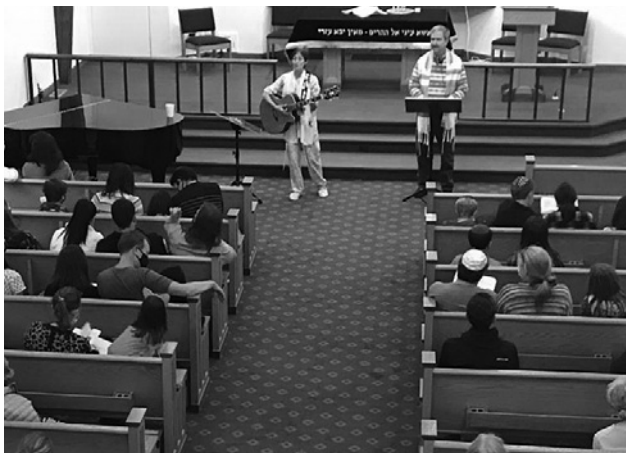
PJ Shabbat with the Religious School

*Private B'nai Mitzvah training is available for an additional fee. No one in our community will ever be excluded from religious school for financial reasons. Please contact the office if you need to make special arrangements.