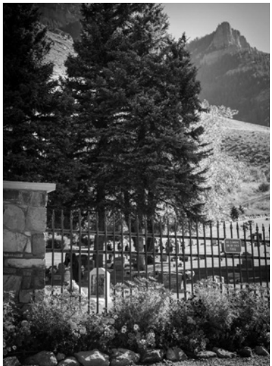
B'nai Vail Cemetery in Minturn