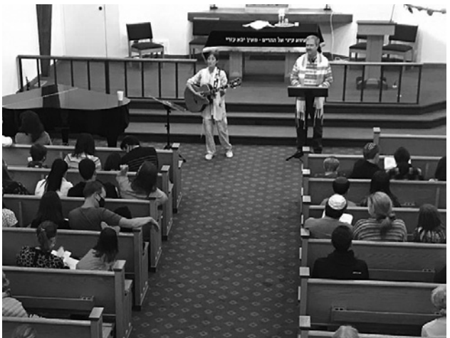
PJ Shabbat with the Religious School

*Private B'nai Mitzvah training is available for an additional fee. No one in our community will ever be excluded from religious school for financial reasons. Please contact the office if you need to make special arrangements.